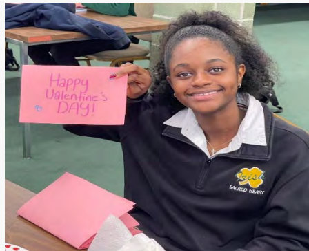
Sacred Heart High School students gathered for their second afternoon of service of the academic year. Students created 187 Valentines for the residents at Cabrini of Westchester!