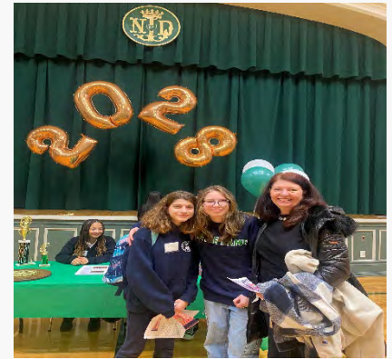
Notre Dame School of Manhattan was pleased to welcome approximately one hundred and fifty 8th graders and their family members to its "Accepted Students Night."