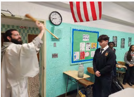
Catholic School's Week Blessings at Cardinal Spellman High School. Blessed and highly favored!