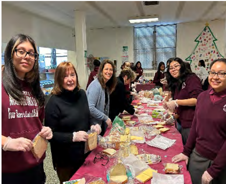
On the International Day of Serviam, AMSU held its first Serviam Saturday! The Academy of Mt. St. Ursula community gathered to celebrate St. Angela's legacy and serve their neighbors in need.