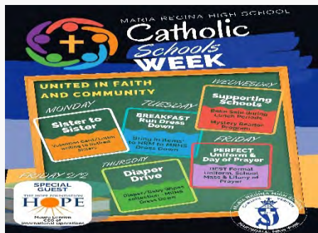
Maria Regina celebrated the 50 th year anniversary of National Catholic Schools Week with a wide range of special daily activities that help develop women of faith in word and deed.