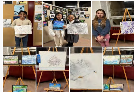
Albertus Magnus hosts Annual Art Show & Contest for Catholic Schools Week in which neighboring Catholic Elementary Schools were invited to participate.