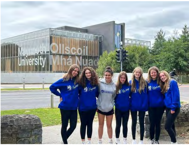
Maria Regina High School