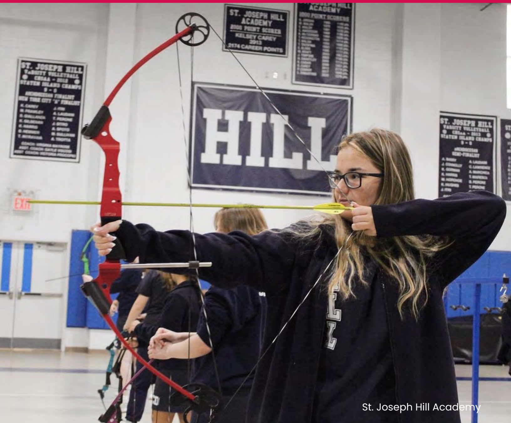
St. Joseph Hill Academy

To learn more about Catholic high schools in the Archdiocese of New York, visit catholicschoolsnyc.org/secondary .