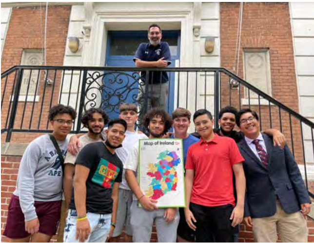
All Hallows High School