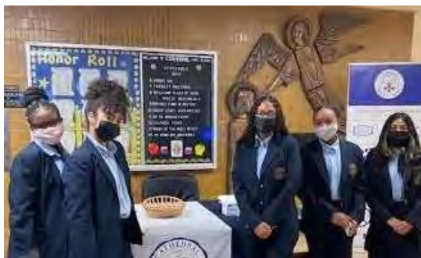
Cathedral High School